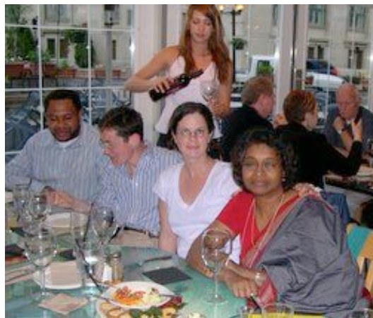
The Philosophers and Friends of Philosophers Dinner at the Spadina Freehouse.